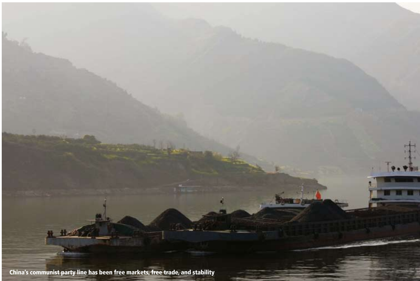
China's communist party line has been free markets, free trade, and stability