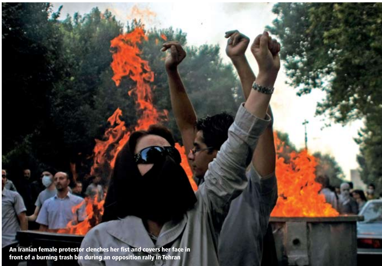
An Iranian female protestor clenches her fist and covers her face in front of a burning trash bin during an opposition rally in Tehran